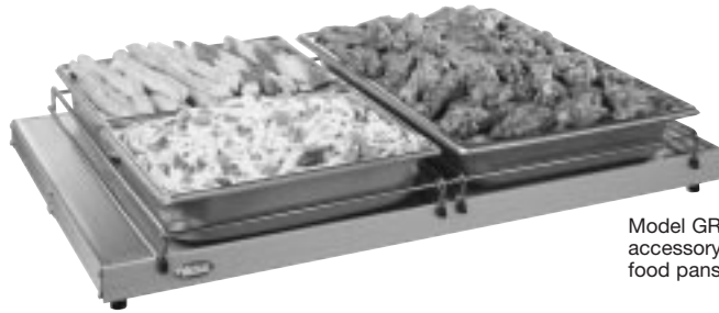
Model GRS-30 with accessory pan rail and food pans