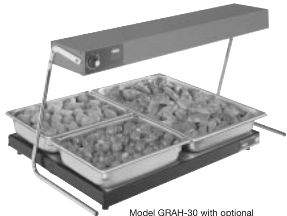
Model GRAH-30 with optional Designer color and infinite switch and accessory C-Leg stand over Heated Shelf model GRS-24 in optional Designer color

BLANKET ELEMENTS GUARANTEED AGAINST BURNOUT AND BREAKAGE FOR ONE YEAR.