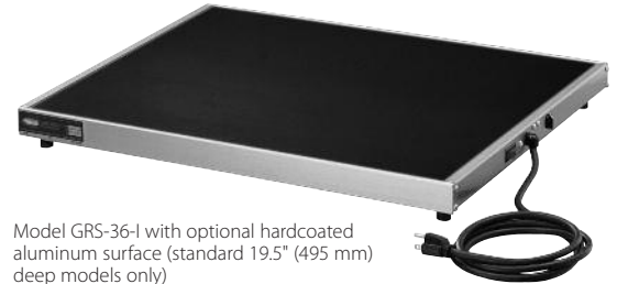
Model GRS-36-I with optional hardcoated aluminum surface (standard 19.5" (495 mm) deep models only)