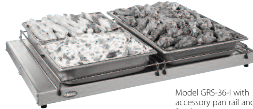
Model GRS-36-I with accessory pan rail and food pans