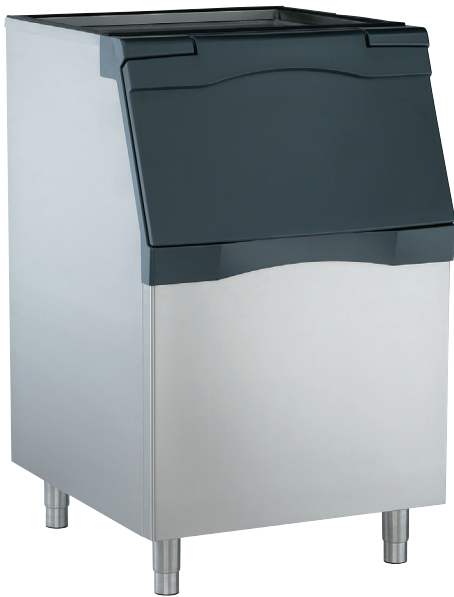
B530S shown with optional KLP8S legs