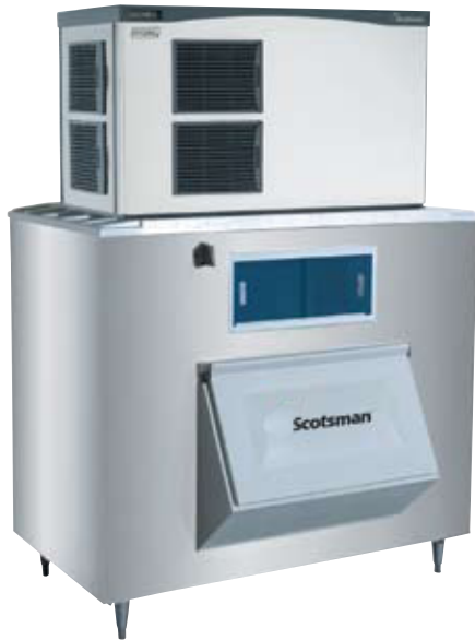
Shown on BH1600SS bin.