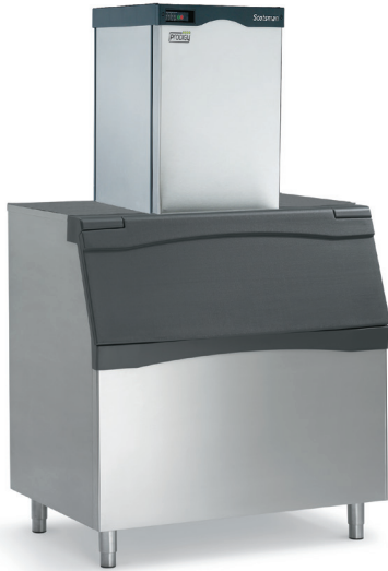
Shown on B948S bin with optional KLP85 legs.