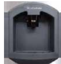
Easy Push Chute