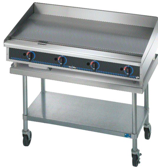
Model 648MD with Optional Equipment Stand

Star-Max griddles feature 3/4" thick polished steel griddle plate, 4-1/2" high wrap-around stainless steel splash guard and 3-1/4" wide front access grease trough with 4-1/2 quart grease drawer capacity. Includes a 20,000 BTU aluminized steel burner every 12" of width controlled by manual control valve with standing pilot light, 3/4" N.P.T. male gas connection with convertible pressure regulator, and 4" adjustable legs. These units are approved for installation within 6" of non-combustible surfaces. Griddles operate on Natural or Propane gas.