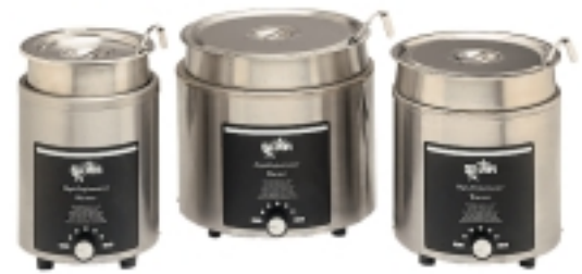
Model 4RW, 11RW & 7RW