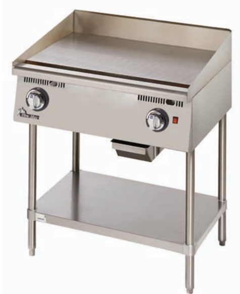
Model 824TSCHSA (stand optional)