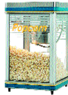
Model G8-Y (8 oz) & G12-Y (12 oz)