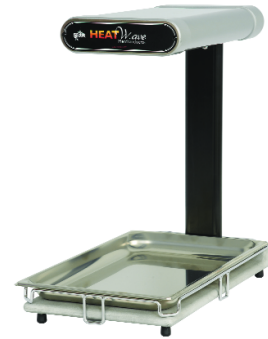
Model HWP-2CL shown with pan accessory

Star's Heat-Wave Portable Warmers™ are covered by Star's one year parts and labor warranty.