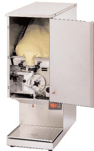
Model SPDE1HP Open (Cheese Not Included)

Peristaltic dispensers are covered by Star's one year parts and labor warranty.