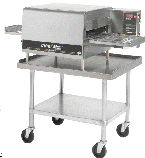
UM-1850A with Optional Stand