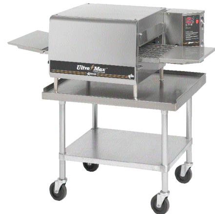
UM-1833A with Optional Stand

Star's Holman Ultra-Max electric conveyor ovens are covered by Star's one year parts and labor warranty.