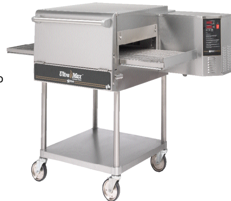
UM-1854 (Single) with Optional Stand