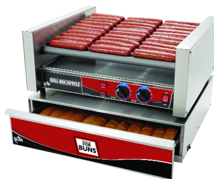
Models X30S Shown with XBW30

Star's Grill-Max ® Express ™ Roller Grills are covered by Star's one-year parts and labor warranty.