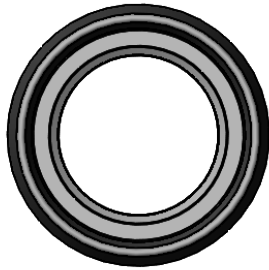
Black Tapered Rubber Bumper