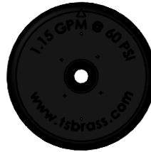
Black 1.15 GPM Spray Face