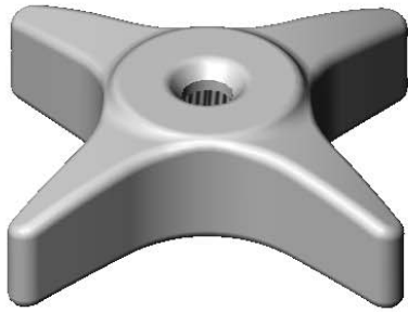
002521-45 4-Arm Kitchen Handle (Qty 2)