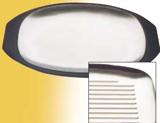
Platter with grid design.

Dinner or serving platter in rectangular design, 8-3/8" x 12-1/4". With or without grid design. Solid cast aluminum in burnished or frosty finish or die cast aluminum in burnished finish. Shipped 12 per case. Matching insulating bakelite holder available, order separately.