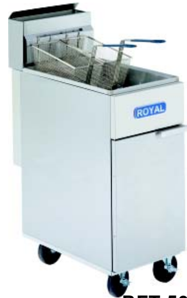
RFT-50 Shown On Optional Casters