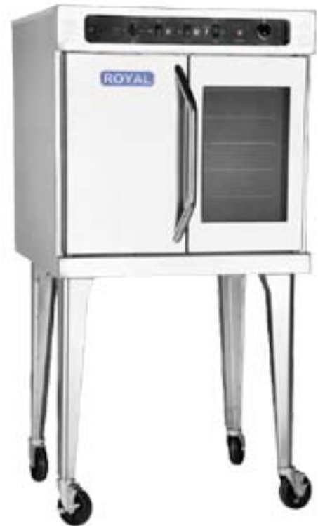
RECO-1 Shown With Optional Casters