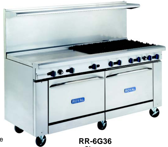
RR-6G36 Shown With Optional Casters