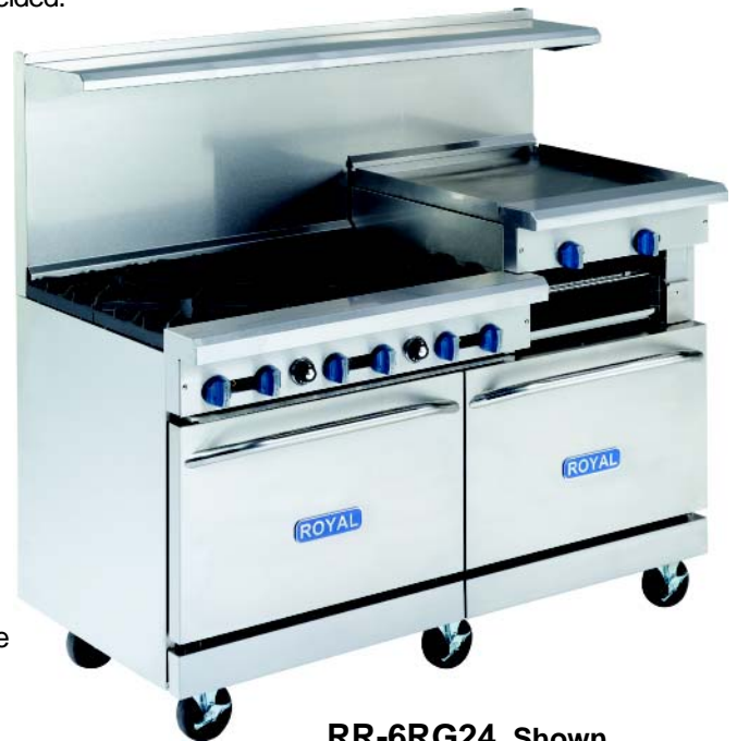
RR-6RG24 Shown With Optional Casters