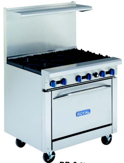
RR-6 Shown with optional casters

Royal Restaurant ranges have been designed to give the most useful features at an affordable cost. All stainless steel sides, and front panels, including the oven doors and kick plate are easily cleaned and rugged enough to withstand the constant heavy usage of a busy kitchen. Oven interiors are porcelain coated on all contact surfaces for fast and easy cleanup. The ovens are thermostatically controlled with 100% safety on the pilots to shut off the oven gas flow if the flame should go out. There is a push button ignitor for easy lighting of the oven pilot. 12" x 12" heavy cast iron grates (18" x 24" on RR-4-36) cover the unique two piece lift off burners, rated at 30,000 BTU/hr. each.