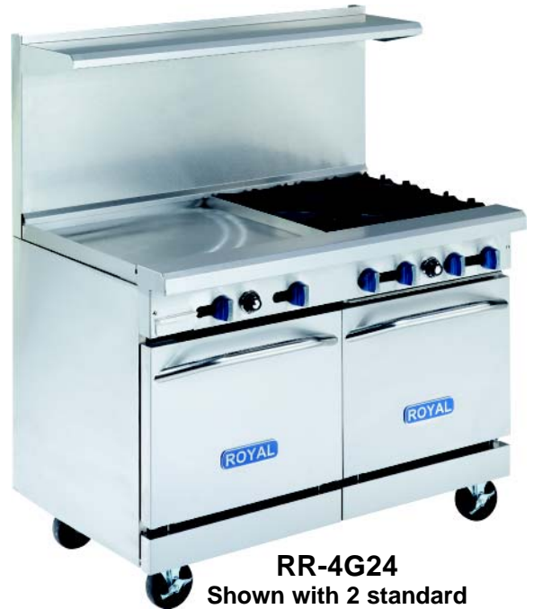
RR-4G24 Shown with 2 standard 20-1/2" wide ovens with optional casters