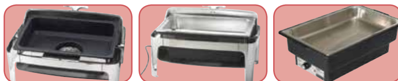
Can be used inside standard size chafers