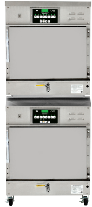
CAC507 STACKED PAIR CVap® COOK & HOLD OVEN 8000 Series Electronic Controls

Allow at least 2" (51 mm) clearance on sides, particularly around ventilation holes. Allow at least 18" (457 mm) clearance from heat producing equipment, such as ovens or fryers. Generally this equipment does not need to be installed under a mechanical ventilation system (vent hood). Check local health and fire codes for requirements specific to your location. Unit must be installed at level.