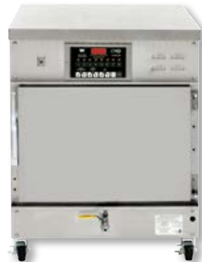
CAT507 CVAP® THERMALIZER OVEN HALF SIZE MODEL WITH FAN 8000 Series, 8 - Channel Electronic Control

CVap equipment complies with domestic and international requirements such as UL, C-UL, UL Sanitation, CE, MEA, and others.