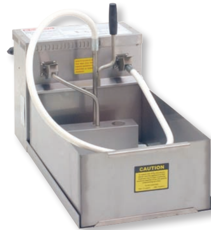
F552A8 SHORTENING FILTER

Winston Shortening Filters are built to comply with all domestic, and most international requirements, such as UL, C-UL, UL Sanitation, CE, MEA, and others.