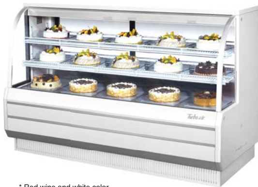
* Red wine and white color come standard