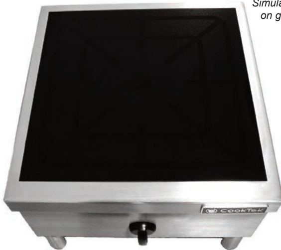
Simulated burner design on glass-ceramic top