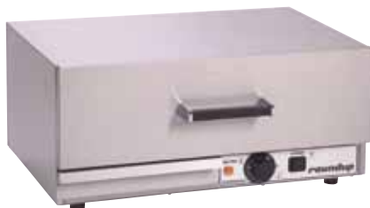
WD-21A with water tray