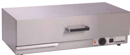
WD-35A with water tray

The Roundup® Warmer Drawer keeps bread products warm and fresh* using easily adjustable controls that allow you to tailor the temperature required for your bread product.