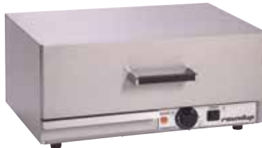
WD-20 with water tray