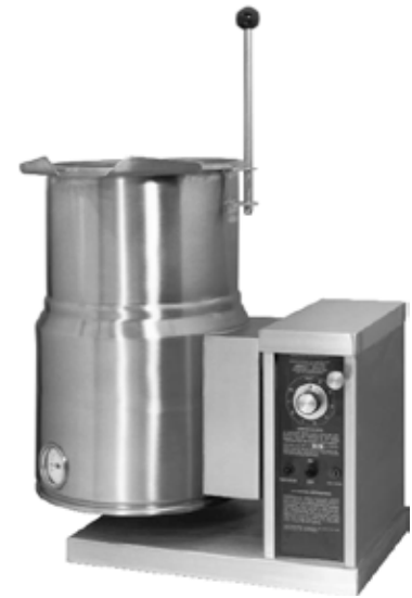
ACEC-6TW Model Shown