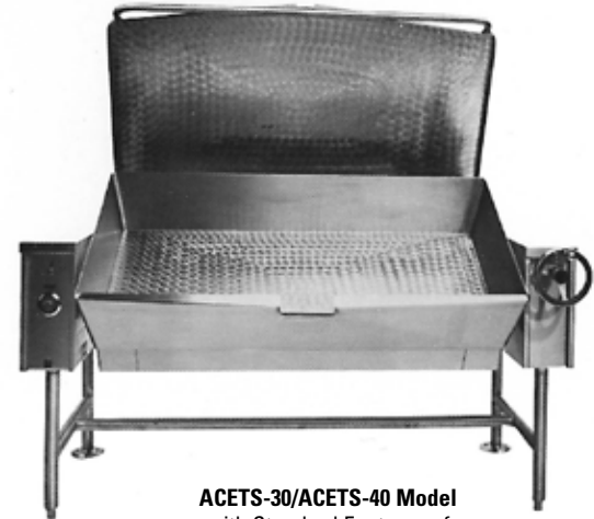
ACETS-30/ACETS-40 Model with Standard Features of Adjustable Bullet Front Feet and Rear Flange Feet

The pan sides shall slope outward to facilitate access to the cooking surface. A worm and gear tilt mechanism shall allow the pan to tilt forward manually for complete emptying of contents. Heating shall be accomplished by electric elements cast embedded in a full 1-1/2" (38 mm) thick aluminum casting bolted to the underside of the pan for even heat distribution across the entire surface. Pan shall pivot on side trunnions connected to the gear and control consoles. The consoles shall be drip proof, stainless steel clad and shall be supported by a heavy duty frame with front legs fitted with adjustable bullet feet and rear legs fitted with flange adjustable feet for securing to the floor. The controls shall be mounted in the left console and shall include a thermostat, power switch and pilot light. As a safety feature the pan shall be equipped with a high limit thermostat cut off. The skillet shall operate at temperature range of 160°F to 445°F (71°C to 229°C) with a high temperature safety cut-off at 536°F (280°C).