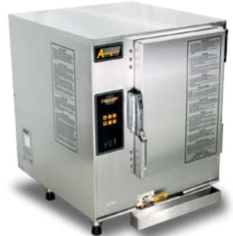
E6 Evolution Model shown with optional bullet feet

Evolution steamer is AccuTemp Products' connected, boilerless steam cooker that utilizes AccuTemp's Patent Pending Steam Vector Technology for faster cook times, improved energy efficiency, better pan to pan uniformity, and less water consumption. Steam Vector Technology requires no moving parts inside the cooking chamber. Steam to be produced inside the cooking cavity with no heating element exposed to water. Easily connects to water and drain line. Uses less than 1.5 gallons of water per hour. Unit to include low water, high water, overtemp warning lights and auto shut off feature. Evolution to include heavy duty, field reversible door. Standard digital controls with independent timer. No water quality exclusions to warranty and no water filtration or treatment required. Unit to be UL Safety and Sanitation Certified, and Energy Star qualified. Built in USA.