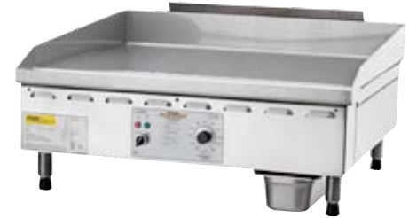
GGF-A36 Accu-STEAM™ Tabletop Griddle (also available with bullet or flanged feet)