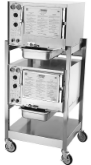
S3 Models shown with 4" drain pan (optional), and stainless steel support stand (optional).