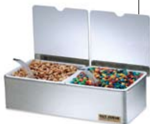
(Spoons not included.)

Individual Notched Lid Condiment Trays are perfect for dispensing non-chilled condiments. Great for use in ice cream stations.