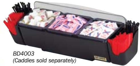
BD4003 (Caddies sold separately)

SEE A DEMO NOW www.sanjamar.com/barsmart