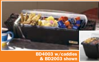
BD4003 w/ caddies & BD2003 shown

The Dome® makes food prep and condiment organization easy. The patented dome lid seals tight to keep food fresh, yet rotates back for easy access. Use standard size trays to keep food chilled or deep trays for extra capacity. Snap-on caddies are available to replace handles for holding sticks, straws or spoons. The Mini Dome® offers all the benefits listed, but in a small footprint. In addition we include one connector with each Mini Dome® allowing you to connect multiple Domes® together.