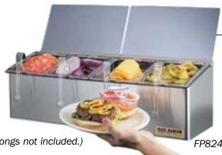
(Tongs not included.)