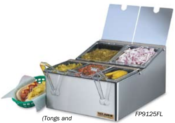
(Tongs and spoons included.)