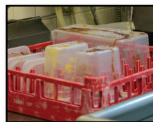
Dishwasher safe, Microwave Safe and BPA Free