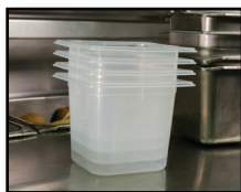
When not in use, nest together for compact storage