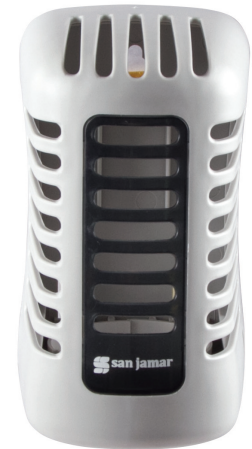
WPI07 80 1202 (Gray) WPI07 80 1203 (White)