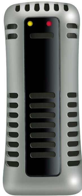
WF107 80 1204 (Gray) WF107 80 1206 (White)