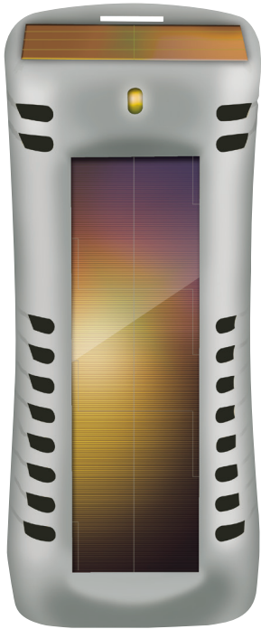
WS107 80 1207 (Gray) WS107 80 1208 (White)