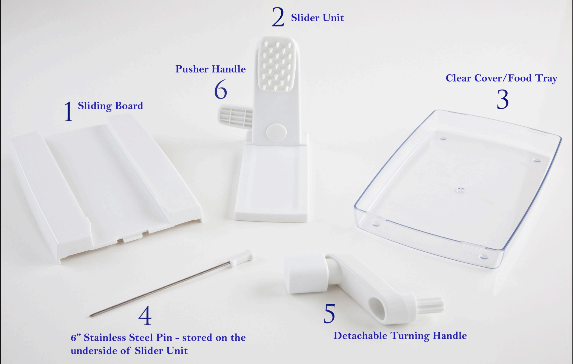
1 Sliding Board