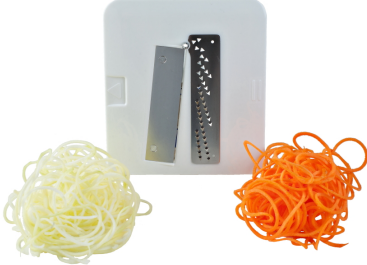
Shredding Blade 3x3 mm