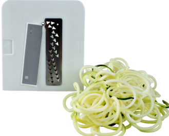
Chipping Blade 4x6 mm