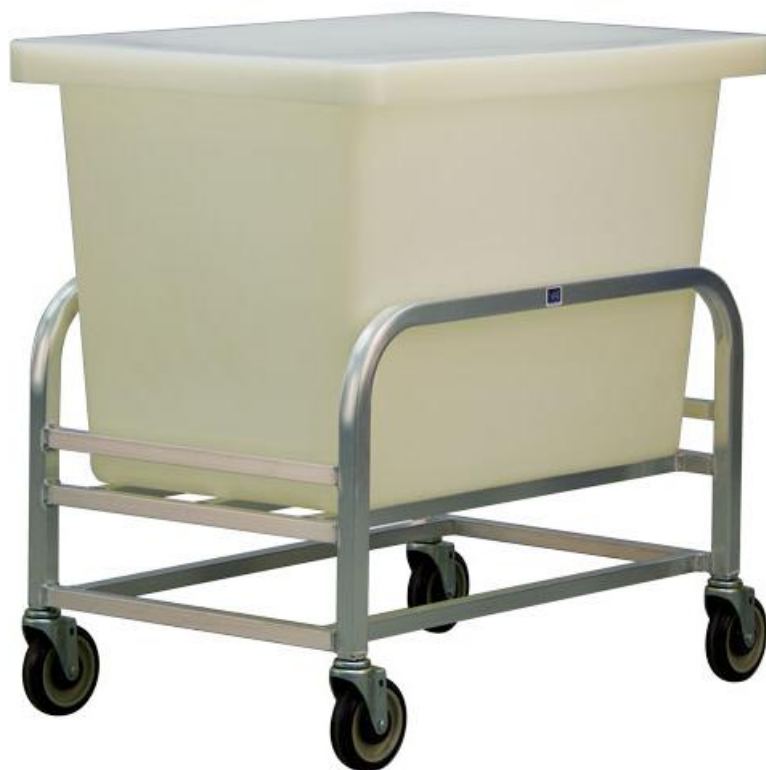
Model #99273 frame Model #0360 tub

These bulk movers carry a Lifetime Guarantee against rust and corrosion and also carry a Five-Year Guarantee against workmanship and material defects.