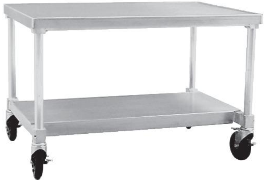
EQUIPMENT STAND SHOWN WITH OPTIONAL UNDERSHELF AND CASTERS

This all purpose stand is perfect for counter-top cooking as well as holding or serving equipment. Removable heavy-duty 12-gauge aluminum top and optional under shelf lift off for easy cleaning and are fully supported by the all welded, heavy-duty frame. Marine edge provides easy cleaning and equipment stability. Adjustable posts allow for quick stabilization and easy leveling on stationary units while 5" stem type casters provide smooth transportation for mobile units.