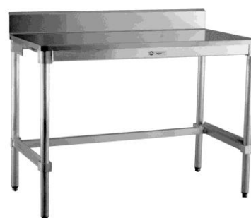
Stainless Steel Top with Backsplash