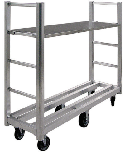
95762 With 95762RS