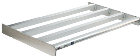
H.D. Bar Shelf • 900# Wt. Capacity