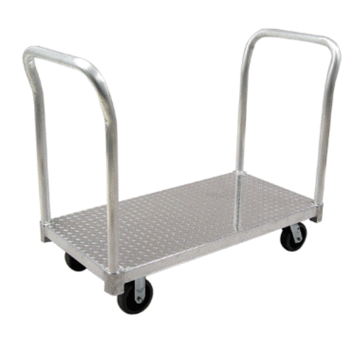
Tread Plate Deck