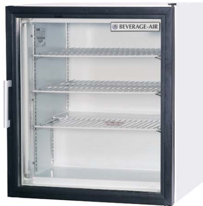
CF3 (unit shown without leveling legs installed)