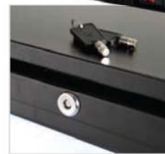
Door Locks Standard