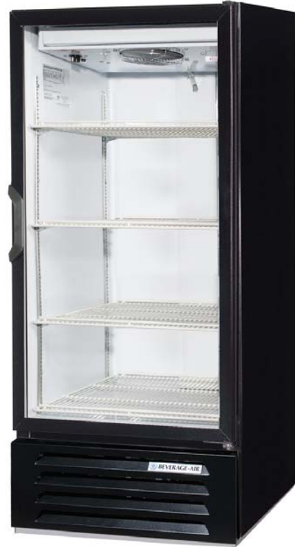
LV10-1-B (shown with optional fourth shelf)

MODELS: LV10-1-B LV10-1-W LV10-1-B-LED LV10-1-W-LED